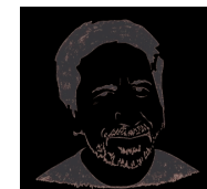
TROPICAL EVOLUTIONARY BIOLOGIST RODOLFO DIRZO