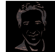
POLAR OCEANOGRAPHER KEVIN ARRIGO